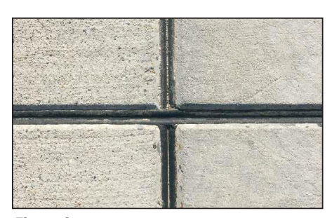
Figure 4 Photo of Properly Installed Compression Seal<sup>2</sup>

Figure 4 provides an example of a well-installed compression seal. The proper installation is to install the longitudinal seal first. After allowing the glue to dry (approximately 20 minutes), the longi-