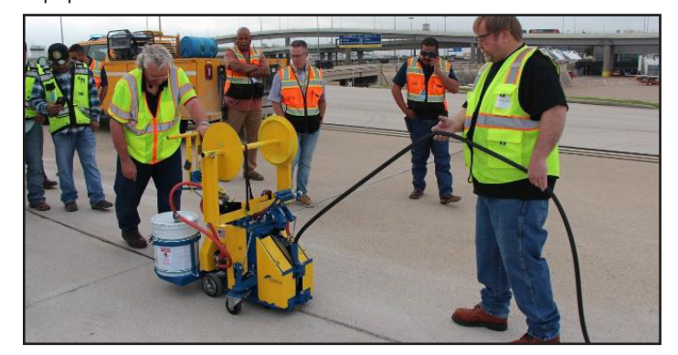
Figure 3 Joint Sealant Installation Equipment

Compression seals are installed using a mechanical device that places the lubricant/adhesive on the seal and installs it at the proper depth. Figure 3 shows an example of the installation equipment.