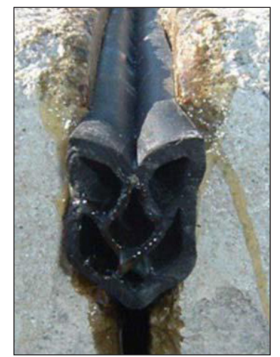
Figure 5 Compression Seal Installed<sup>3</sup>

Since compression seals exert pressure against the joint reservoir walls, fewer sliver spalls appear over time than with liquid sealants which create constant tension on the walls.