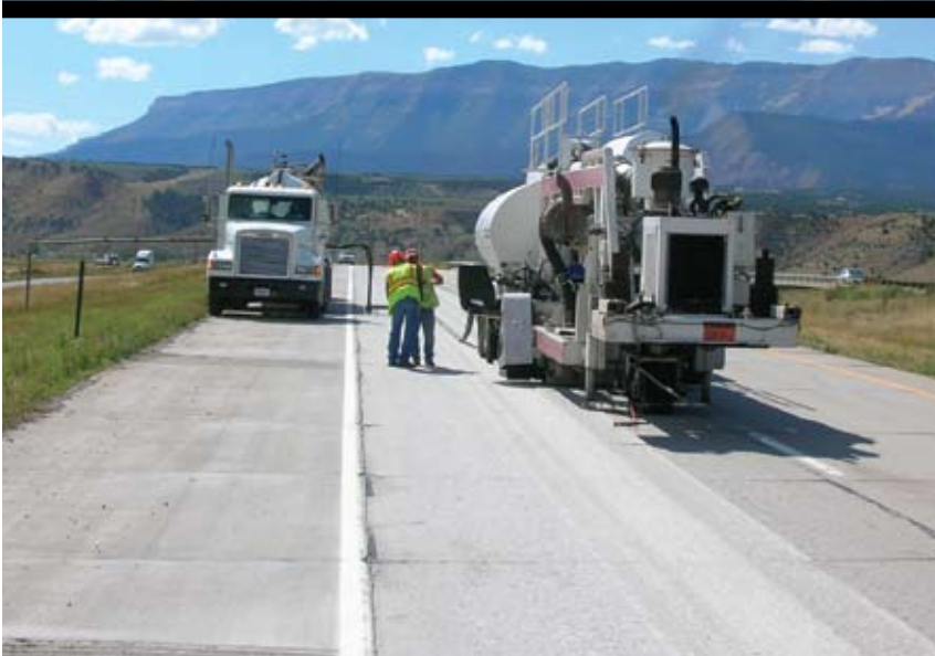
<< Diamond Grinding of I-70 in Colorado

WHILE IT HAS BEEN WIDELY ACCEPTED for years that rough roads lead to diminished safety, higher vehicle operating costs and more expensive road repairs, a recent report sheds light on the true cost. According to a May 2009 report by the American Association of State Highway and Transportation Officials (AASHTO) and The Road Information Project (TRIP) -- a national transportation research organization -- driving on rough roads costs the average American motorist approximately $400 a year in extra vehicle operating costs. Drivers living in urban areas with populations more than 250,000 are paying upwards of $750 more annually because of accelerated vehicle deterioration, increased maintenance, additional fuel consumption, and tire wear caused by poor road conditions.